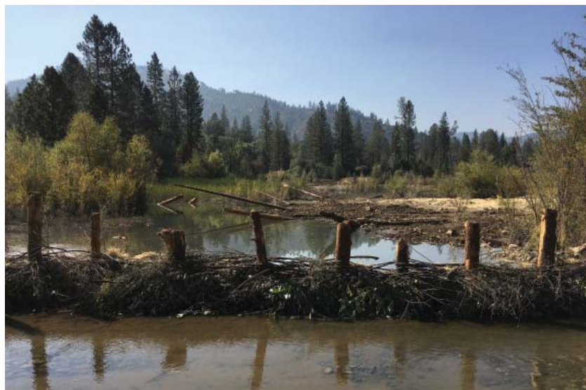
Man-made "beaver dam analog" at Bucktail site.