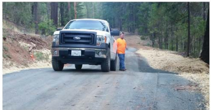
Before and after construction of rocked rolling dip on Roundy Road to reduce erosion.