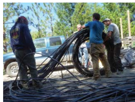
Crews wrapping up miles of irrigation piping.