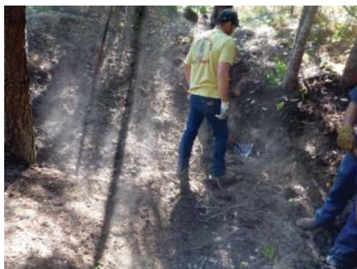
Dubakella Cistern before, during and after.

Research scientists from Integral Ecology Research Center (IERC) were brought into the site to document the magnitude of impact that this trespass grow had. During initial documentation of the site, an estimated several thousand feet of irrigation line, numerous substantial water diversions, significant tree removal, hundreds of pounds of fertilizer and several containers of illegal and restricted use pesticides were recorded. The site was placed on a high-priority list for documentation and reclamation due to these factors, and correspondingly was placed as a site for long-term monitoring for potential legacy influences.