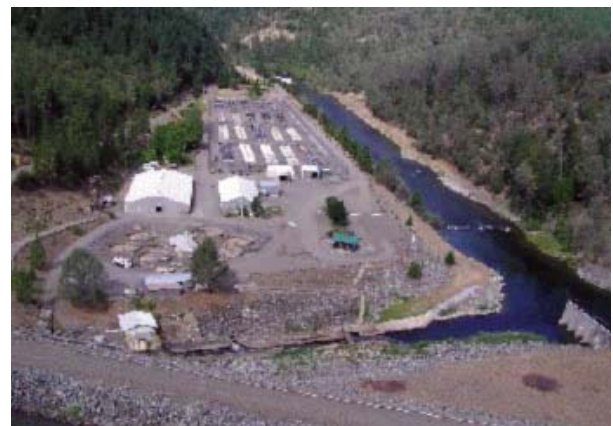
Trinity River Fish Hatchery