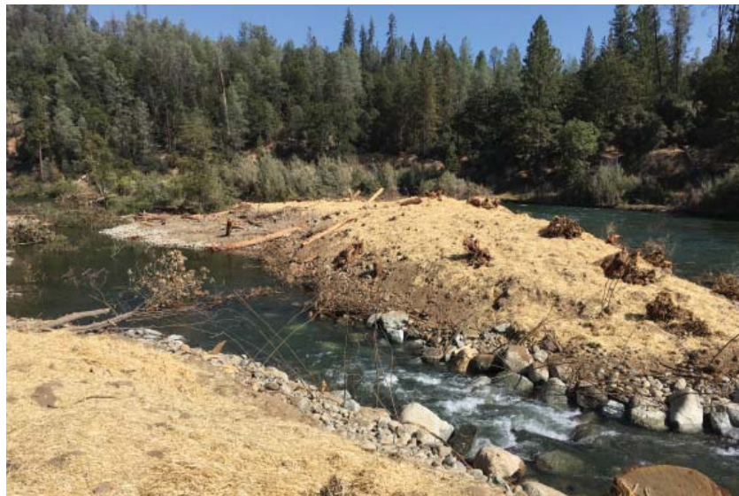
New Side Channel at Bucktail.

The Program hopes to conduct one or more public field trips to the site in Spring/Summer of 2017. Stay tuned!