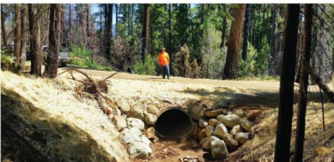
Sims watershed restoration work replaced undersized 24" corrugated metal pipe (top photo on right), with a 48" pipe arch.